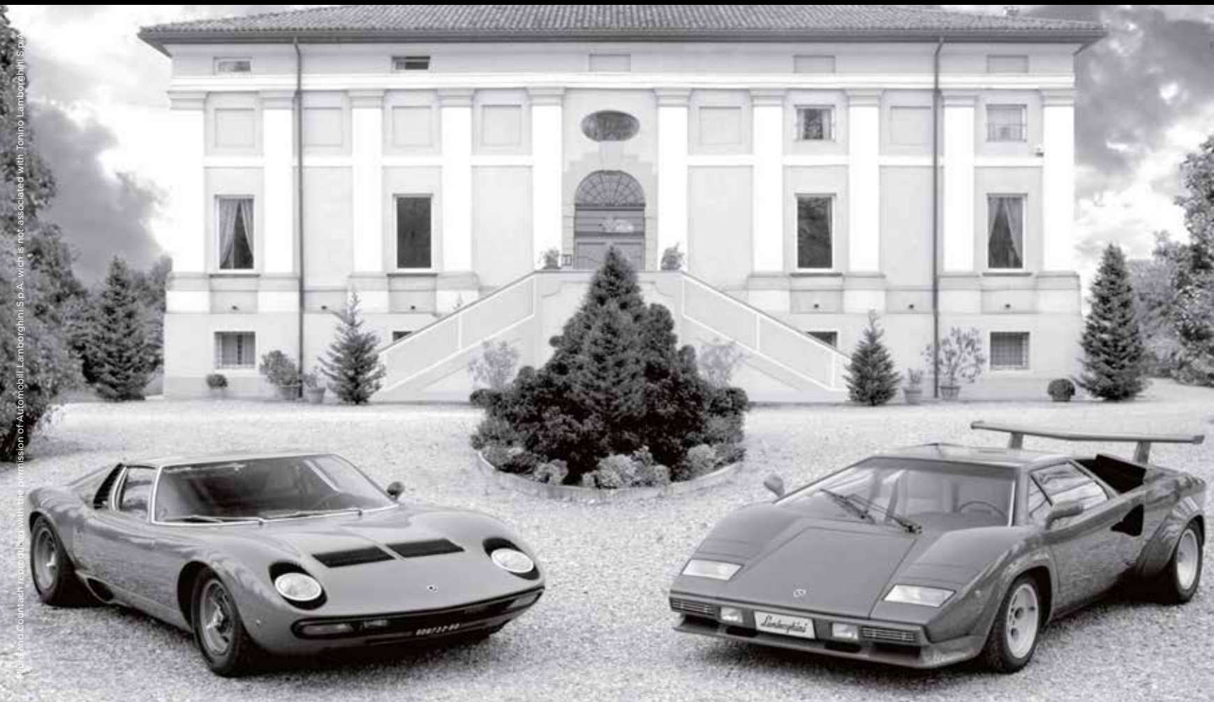
Palazzo del Vignola, Funo di Argelato (BO) Tonino Lamborghini Group Headquarters